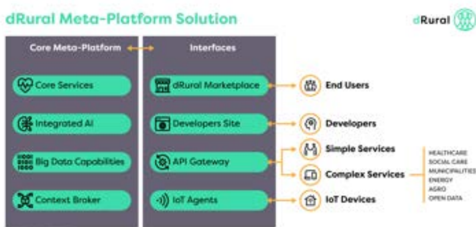
Figure 1 Visual representation of the dRural platform

A high-level conceptual vision of dRural platform is reproduced below: