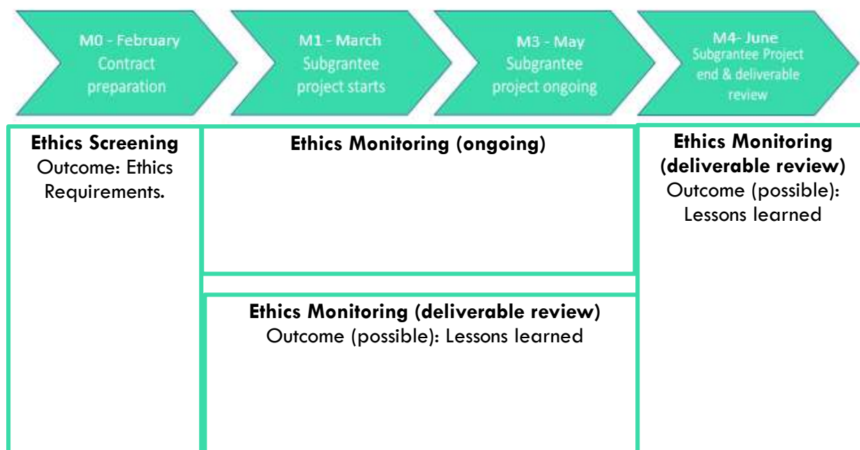
Figure 4 Overall ethics screening and monitoring process for Simple Service Provider projects

The dates mentioned in Section 6 are indicative and will follow the overall timeline of Open Call procedures.