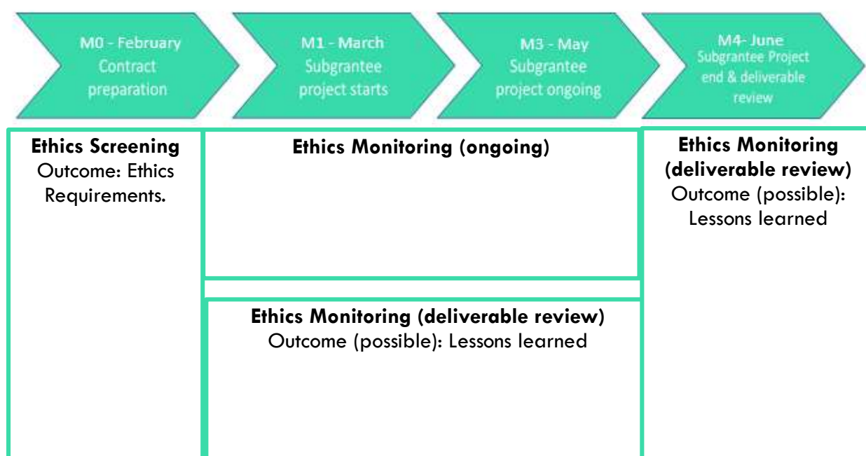
Figure 4 Overall ethics screening and monitoring process for Simple Service Provider projects

The dates mentioned in Section 6 are indicative and will follow the overall timeline of Open Call procedures.